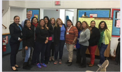
Project 2INSPIRE Mastery Level Graduates

97% of parents in the program reported that they learned things that would have an impact on their family and that would help their child or their child's school.